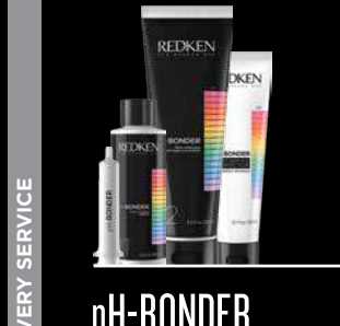
Bond-protecting color and lightener additive. Use with all lighteners and color.