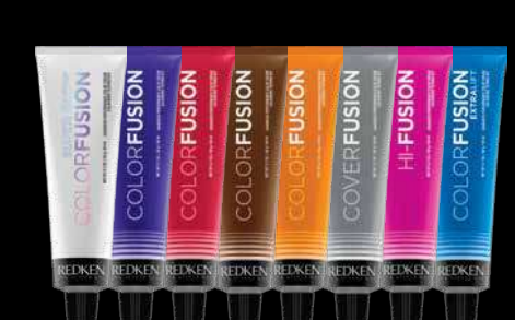
COLOR FUSION NEW SUPER GLOW SHADES Natural-looking, multi-dimensional results with condition and shine.